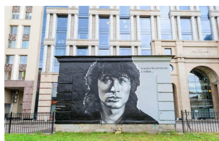
A yard between 8 Vosstaniya Street and 5 Mayakovskaya Street Viktor Tsoi