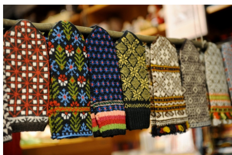
87 Moika Embankment The Museum of Mittens