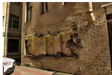
1 Maliy Prospekt, P.S. An interesting map of the USSR