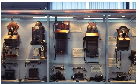
60 Shpalernaya Street The Museum of History of Telephones