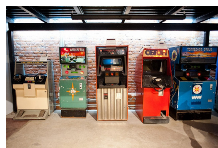
2B Konuyshennaya Square The Museum of Soviet Slot Machines