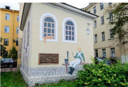
2 Dvoynikov Alley Regiment Yard